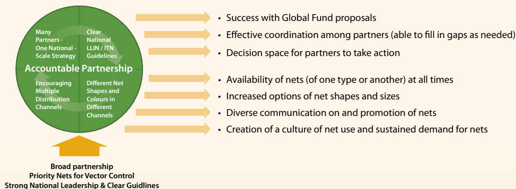
Figure 2. The Role of Government: Creating an Enabling Environment, Ensuring Accountability