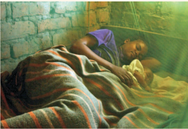
The Malawi NMCP’s ‘green nets’ protect the country’s most vulnerable.

According to those interviewed, the strong, sustained leadership of the Directorate for Preventive Health Services and its National Malaria Control Programme has been the most vital element of Malawi’s success. In addition to the leadership of key individuals within government, Malawi has benefited from the vision and expertise of partner organizations such as WHO, UNICEF, USAID, DfID, CDC, JICA, GTZ, and PSI. When asked to elaborate further, nearly all the interviewees cited the NMCP’s decision to develop with its partners a clear set of national ITN guidelines as the policy action most central to creating transparency and accountability. This has enabled Malawi’s continuous net distribution partnership to work effectively and harmoniously since it was scaled up nationally in 2002.